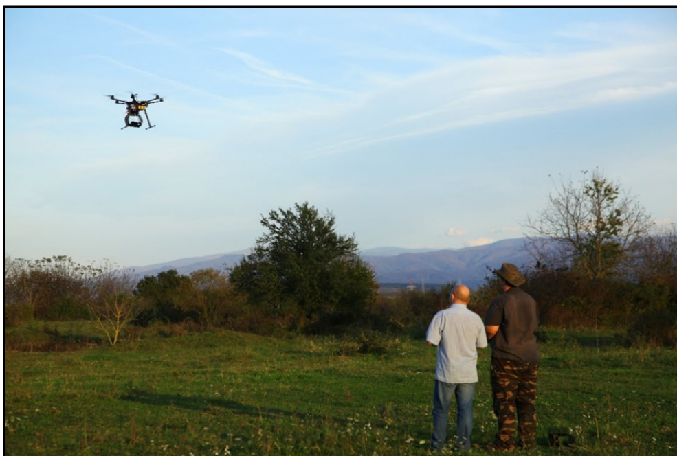
Fig. 2. The evening aerial photography session made with the drone.